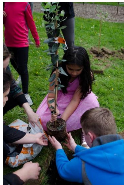
Photo: Children and junior youth in Naenae take the lead in a tree-planting event to mark the bicentenary.

— Universal House of Justice, October 2019