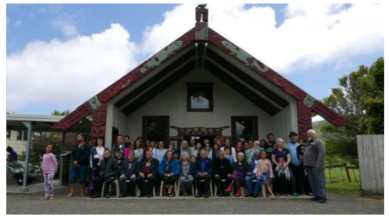
Hui at Roma Marae in Ahipara.

Service. A junior youth group gave cookies to the nurses of a hospital children's ward and sang songs and prayers about unity.