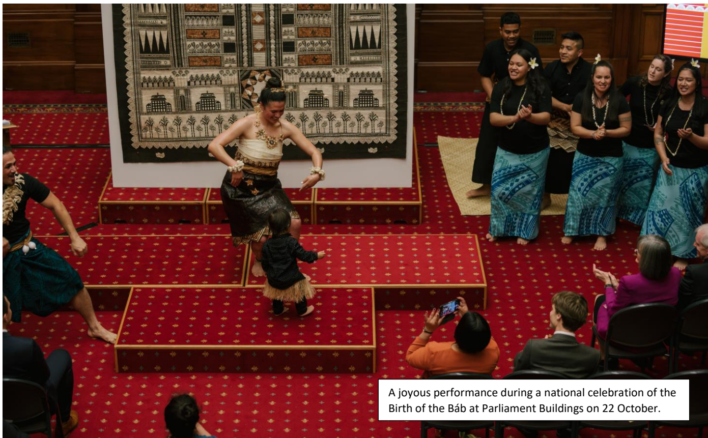
A joyous performance during a national celebration of the Birth of the Báb at Parliament Buildings on 22 October.

A review of the celebration of the bicentenary of the Birth of the Báb and a preview of endeavours to come.