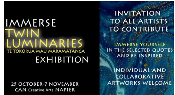
Napier art exhibition poster.