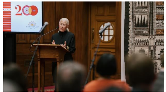
Artist Dame Robin White speaking at the national bicentenary event in Parliament Buildings.