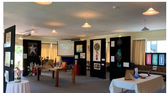
Christchurch art and craft exhibition, initiated by a neighbourhood group.