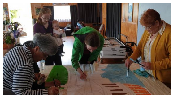
Artistic collaboration in South Waikato.