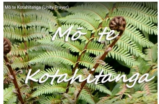
Bahá’í Waiata Project online video.