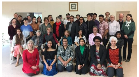
Bicentenary celebration in Dunedin.