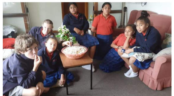
Waitaki junior youth after a planning session.