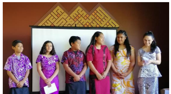
Neighbourhood celebration in Waitakere.