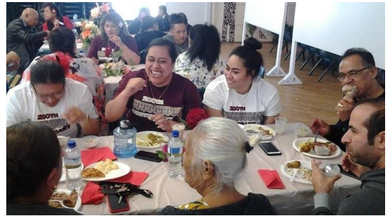
Meal shared by Samoan study circle participants.